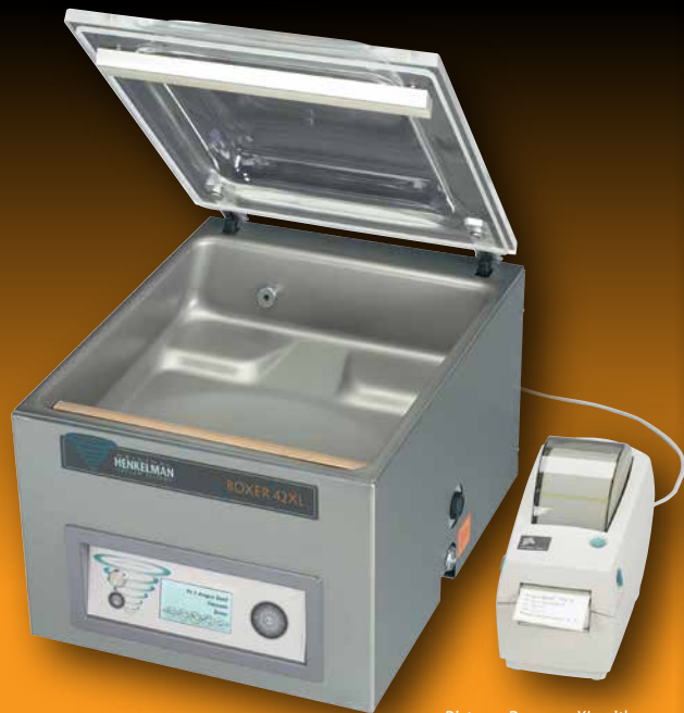
Picture: Boxer 42XL with options ACS and printer