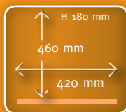
Standard 1 x 420 mm seal