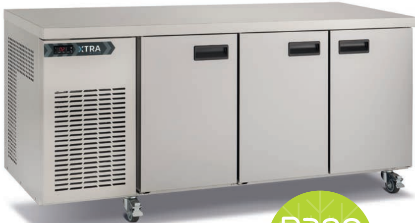
XR3H refrigerated counter