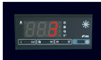
Microprocessor controller provides simple accurate temperature control