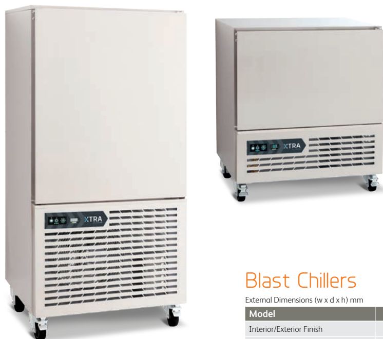
(Right to left): XR35 & XR10/20 Blast Chillers