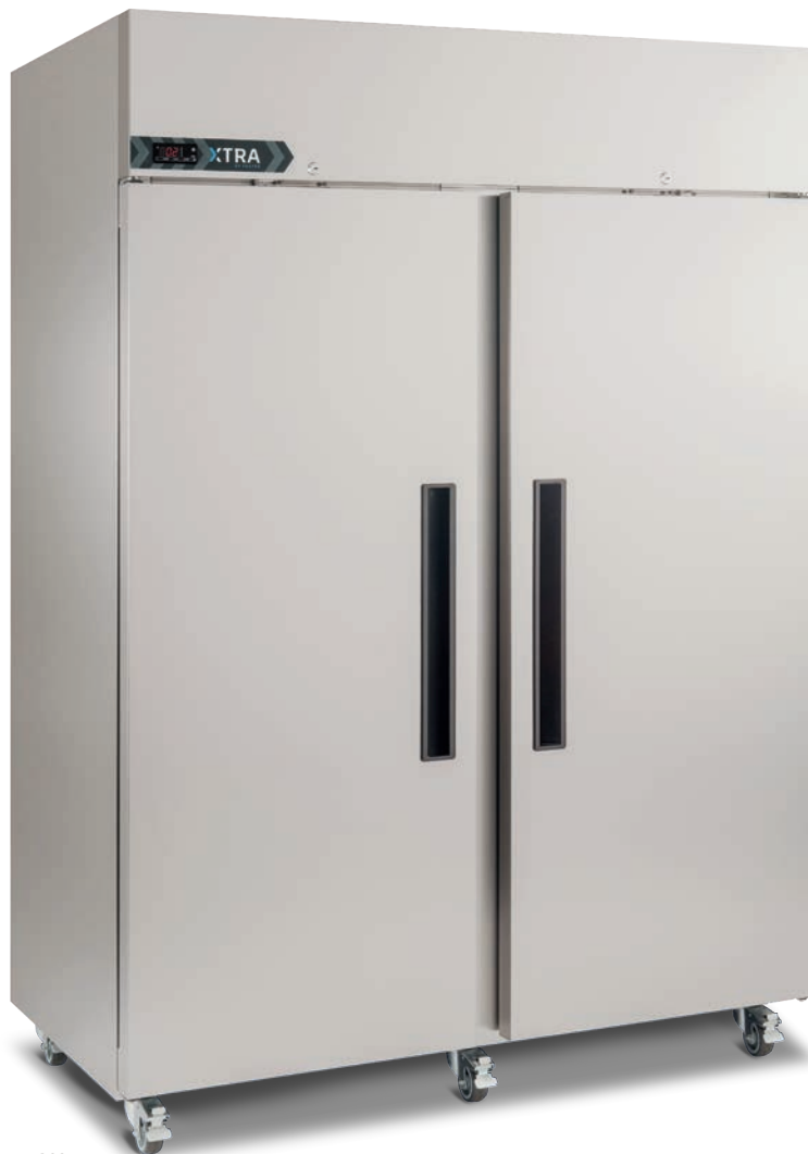
XR1300H 1300 litre capacity cabinet