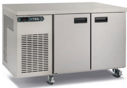
XR2H refrigerated counter