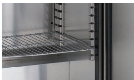
XR415H interior with 4 x Nylon coated wire shelves (480 x 420mm)