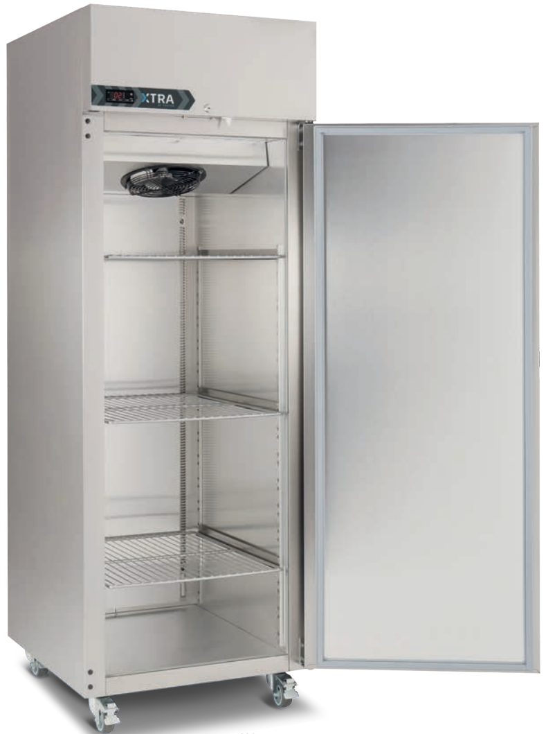
XR600H 600 litre capacity cabinet