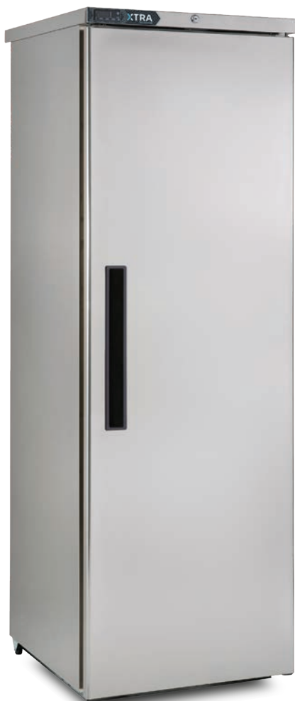
XR415H 400 litre capacity cabinet