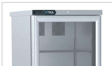
Glass door option also available (ambient operation up to 25°C)

† Product type is not currently regulated by Ecodesign