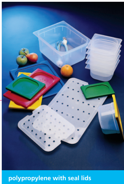
polypropylene with seal lids