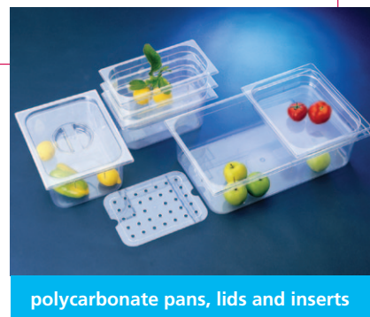
polycarbonate pans, lids and inserts