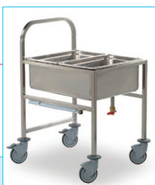
shows 2x1/1 gastro unit with 'water-well'