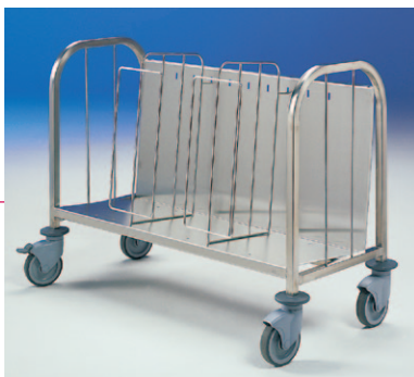
Plate + Gastronorm Pan Trolley

Finish ■ Stainless steel one piece back and base ■ Stainless 25x25mm box section formed frame ■ Stainless 8mm wire dividers