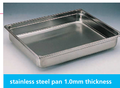
stainless steel pan 1.0mm thickness