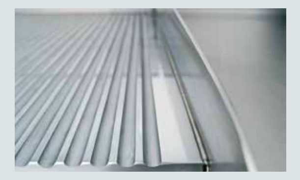
The 3mm splashguard is a fully welded hob surround providing extra durability and ease of cleaning.

With solid and seamless weld construction all heavy-duty Griddles have a standard 20mm plate for maximum heat retention and distribution. They are thermostatically controlled for accurate