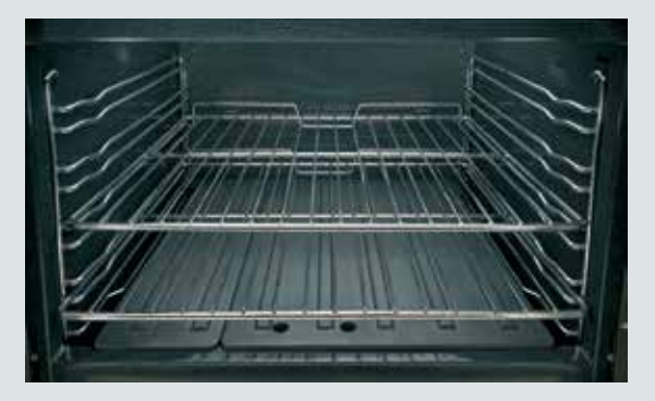
Easy clean, vitreous enamel interior offers 2/1 Gastronorm capacity and generous crown height. Durable cast iron sole plates provide excellent heat retention and recovery.

Within the oven itself, cast iron sole plates ensure even heat distribution. Heavy-duty motors and circulation fans in the convection ovens reduce cooking times and enable food to be cooked at lower temperatures.