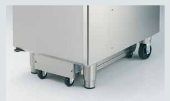
Big on performance, the Blue Seal Evolution Series of tilting Bratt Pans has been expanded to include 80 litre (900mm wide) and 120 litre (1200mm wide) options in gas or electric.

Easy clean, easy service and superb finishing make the Bratt Pan a welcome addition to any Blue Seal Evolution Series kitchen.