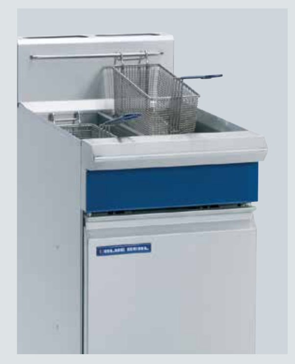
Blue Seal's unique twin pan fryers offer high performance and versatility.

All Fryers are available with either mechanical or digital controls. Digital control models offer precise temperature control, three product timers, as well as time and temperature digital display. Twin pan models have independent digital controls for each pan and six product timers.