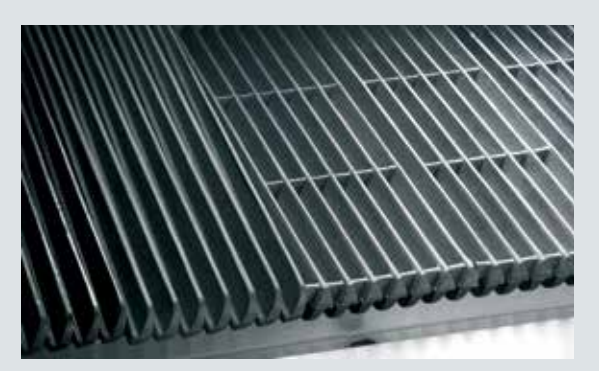
The heavy-duty grates are reversible.

The grooved fin design and inclined position of the heavy-duty cast iron grates reduces flare by enabling grease to run off into a front collection channel. Drop-on 300 and 450mm griddle sections can also be interchanged with the grates.