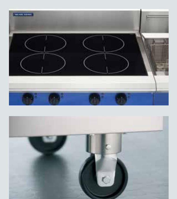
Standard rear rollers make inline cleaning and servicing even easier.

The control design is a large control knob for each induction zone with a (green) indicator light including pan detection indication. Blue Seal Evolution induction cooktops offer the additional benefits of reduced energy consumption and lowering the amount of latent heat in the cooking area.