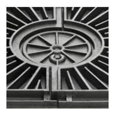
Ask for a detailed specification sheet on any of the Blue Seal Evolution Series Target Tops and Target Top Ranges outlining construction, maintenance and installation information.

Accessories. Mobile castor kit Joining caps